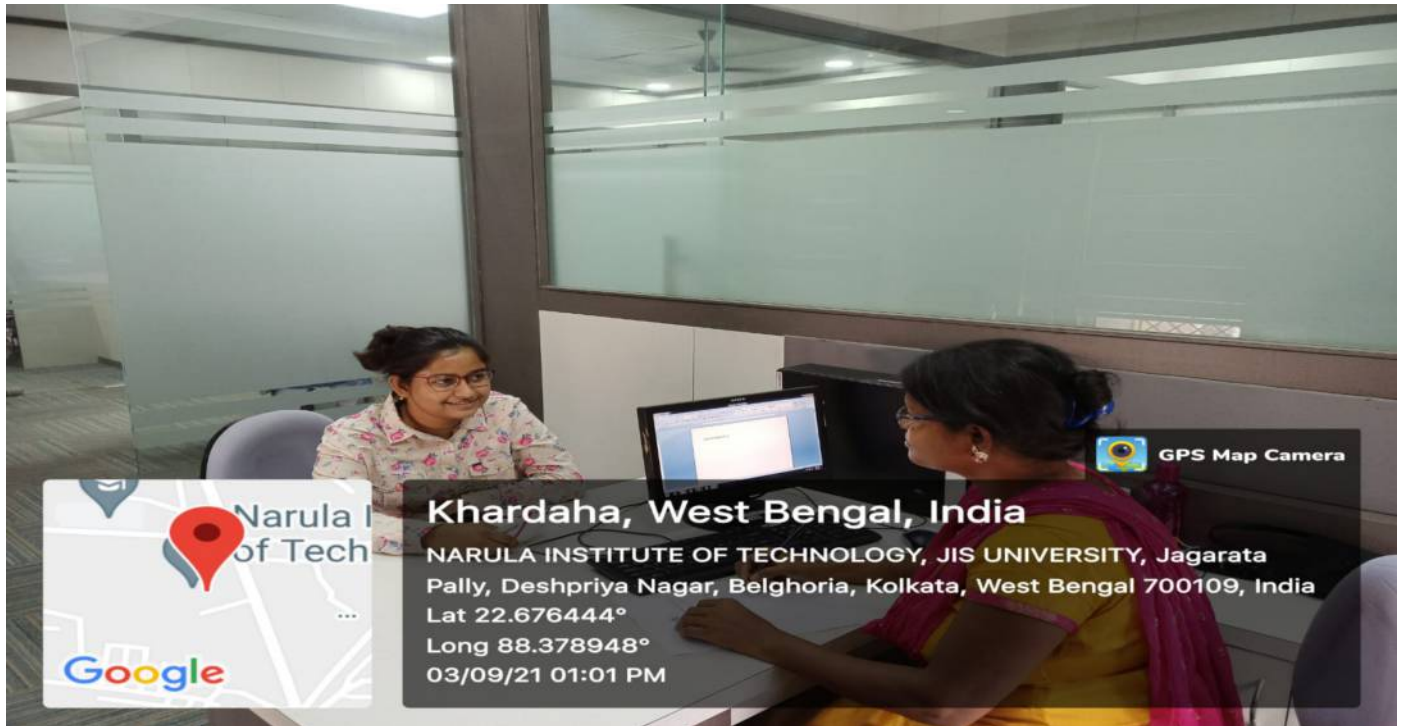
Figure 5: Counseling Room