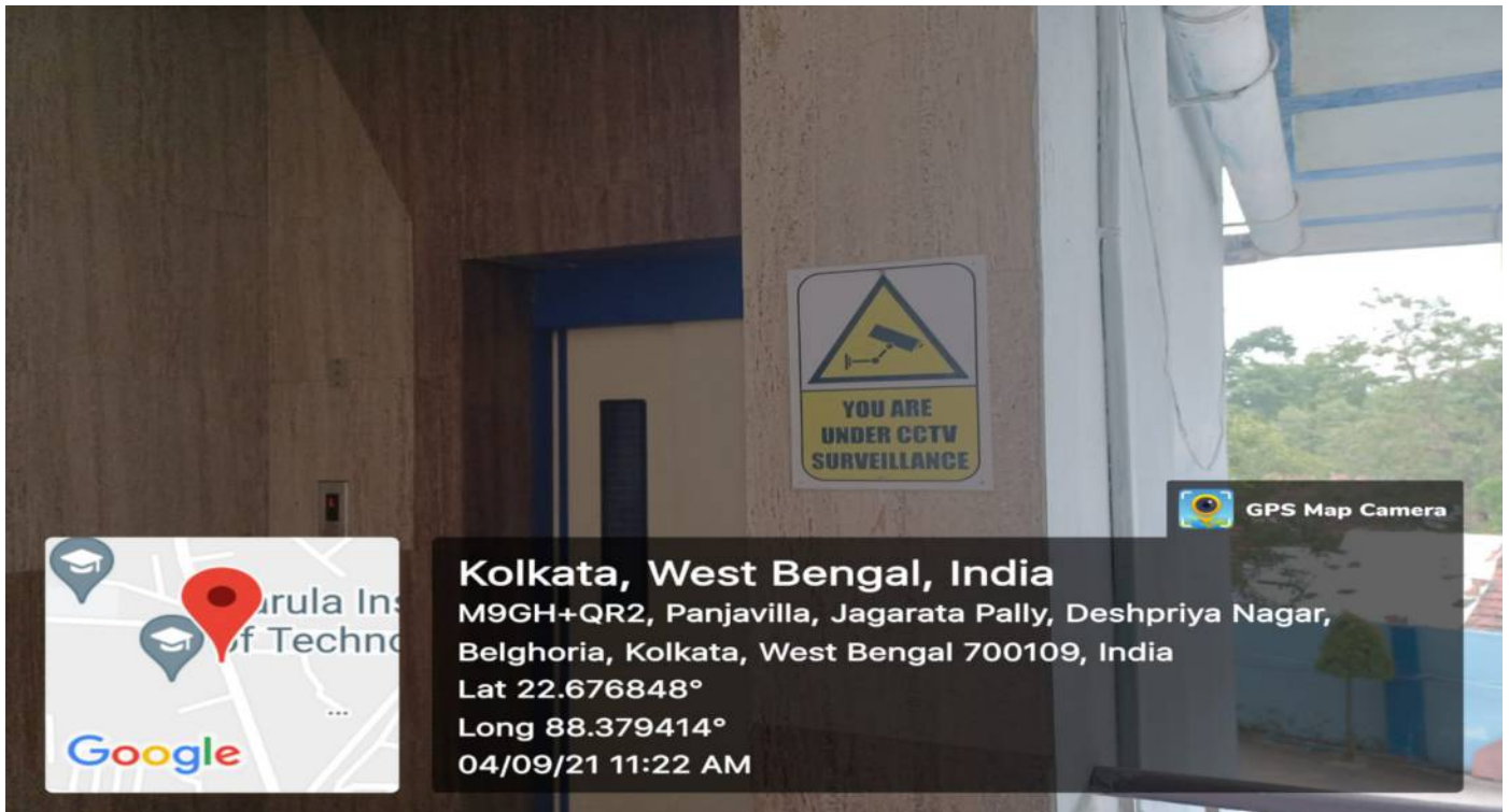
Figure 1: Safety & Security (CC Camera Disclaimer)