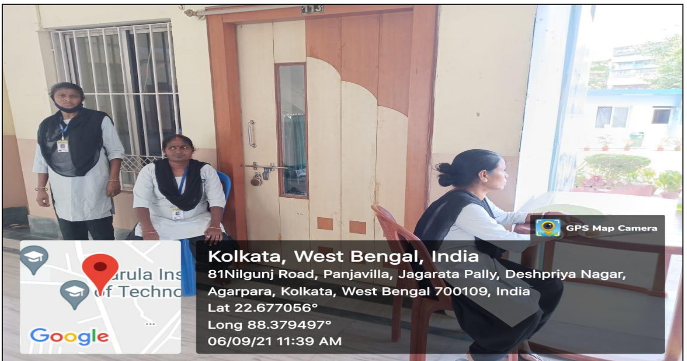
Figure 12: Female Security Guard