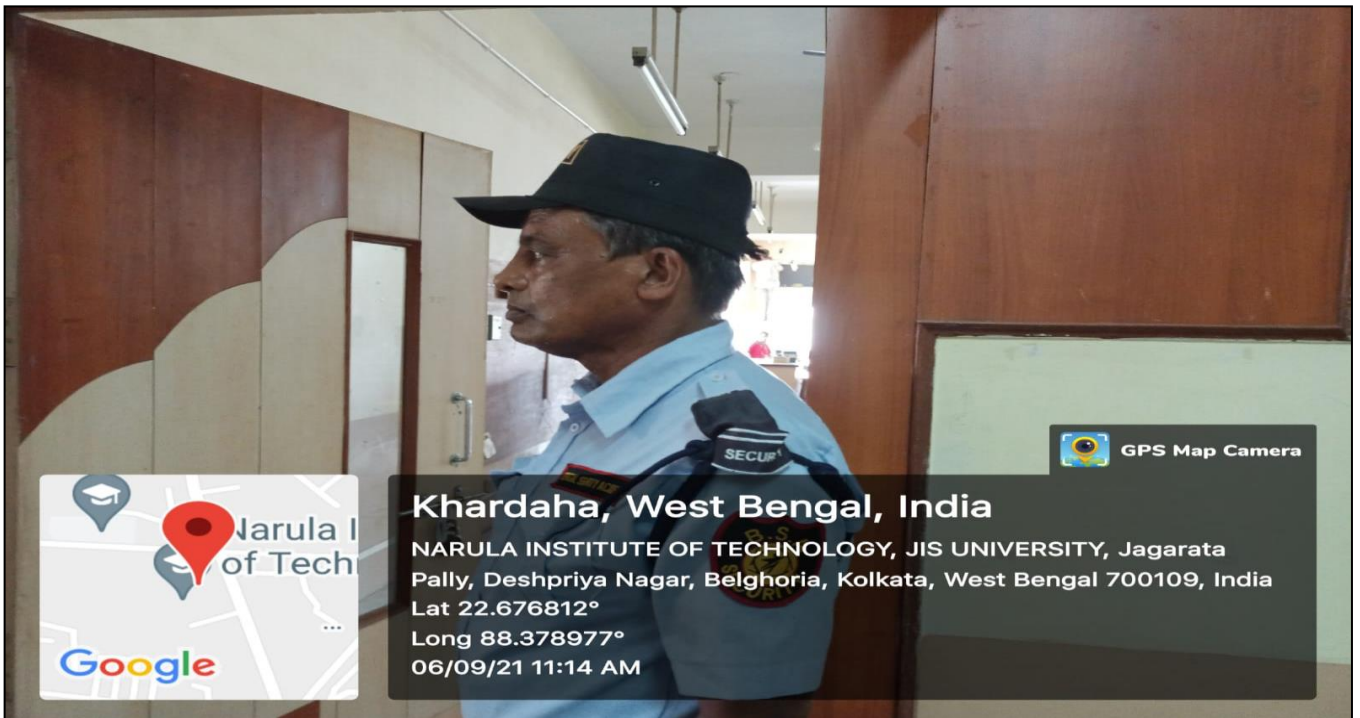
Figure 11: Male Security Guard