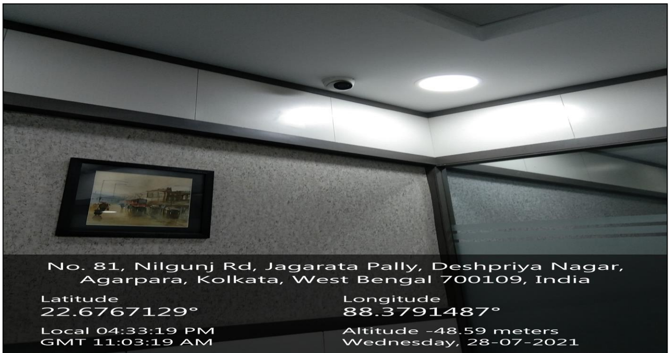
Figure 4: Safety & Security (CC Camera)