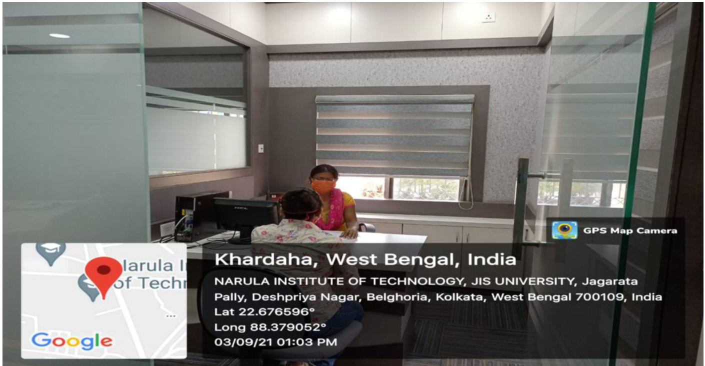
Figure 6: Counseling Room