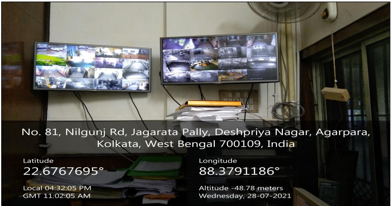
Figure 3: Safety & Security (CC TV Control Panel)