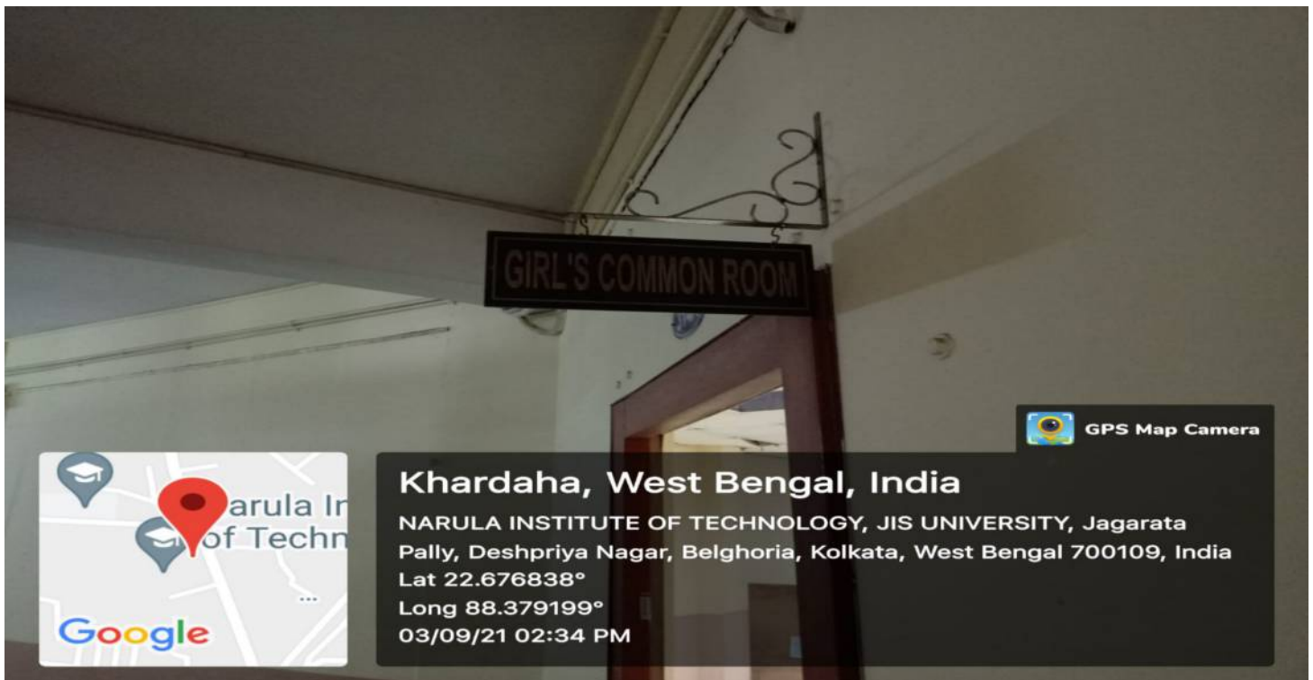
Figure 8: Girl's Common Room