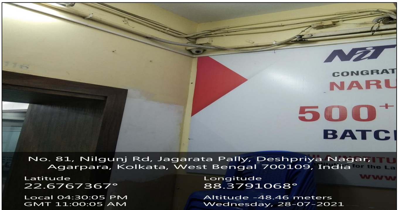
Figure 2: Safety & Security (CC Camera)