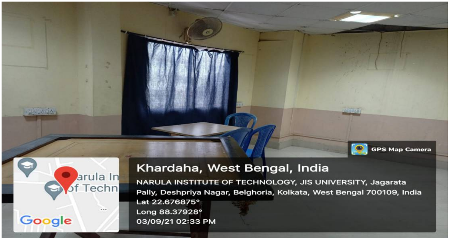
Figure 7: Girl's Common Room